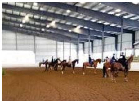
THE TASHA RING TODAY IN THE TELLEPSEN ARENA AT GSWE C

Two decades of TASHA shows were held at the Bear Creek Arena in west Houston, Supreme Acres Stables in Stafford (Fort Bend Co.), and in Liberty County before making a move to the Great Southwest Equestrian Center in Katy and more recently also in Bryan, TX at the Brazos County Expo Center. The show schedules have evolved somewhat and now include a balanced mix of Academy and ASB classes as well as several Open Breed pleasure classes in both western and English disciplines.