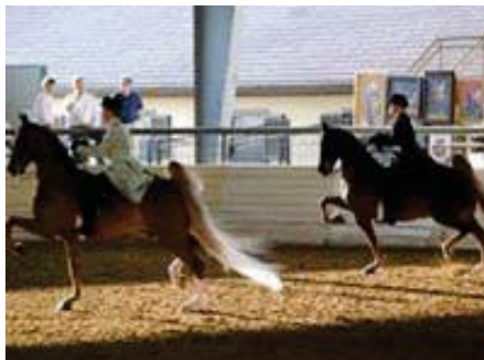
THE TASHA RING TODAY IN THE WHELESS ARENA AT GSWE C

Two decades of TASHA shows were held at the Bear Creek Arena in west Houston, Supreme Acres Stables in Stafford (Fort Bend Co.), and in Liberty County before making a move to the Great Southwest Equestrian Center in Katy and more recently also in Bryan, TX at the Brazos County Expo Center. The show schedules have evolved somewhat and now include a balanced mix of Academy and ASB classes as well as several Open Breed pleasure classes in both western and English disciplines.