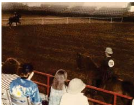
THE TASHA RING AT GSWE C IN THE 1980S

The thought was, if you want the breed, discipline and organizations to survive, you need to provide a gateway for the next generations no matter their financial status. Although Academy horses, or lesson horses, are not always registered Saddlebreds, TASHA mixed the ASB Performance and Pleasure division classes with the Academy classes. This allowed the Academy program exhibitors and their families to see all the beautiful ASB's in the show ring as well. For a time in the 1980s, Academy riders at TASHA shows were even asked to dress in full riding suits, rather than the traditional shirt and vest only, to give them the full show ring experience.