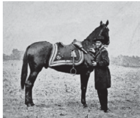
GENERAL GRANT WITH 'CINNCINATI', KENTUCKY SADDLER