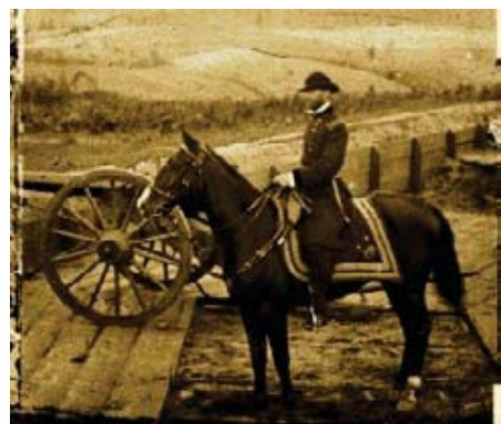
GENERAL SHERMAN WITH 'LEXINGTON', KENTUCKY SADDLER