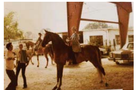
A TASHA SHOW AT BEAR CREEK

TASHA quickly became one of the largest ASHA Charter Clubs in the country. Hosting up to three shows in every calendar year for the last 45 years, the association has certainly lived up to its original mission. Reported as the "All Amateur Horse Show" for years, their shows had many classes dedicated to the Academy programs which were not available at the larger, more popular horse shows across the country. Academy or lesson programs were huge in Texas during the 1970's and 1980's, developing young riders who were eager to show even if they could not yet obtain a horse of their own.